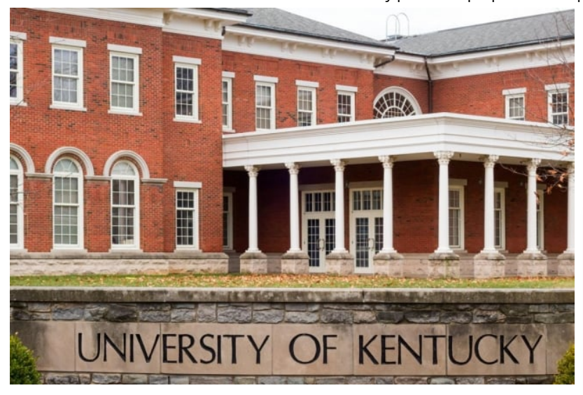
The University of Kentucky's president has proposed dissolving the institution's University Senate.