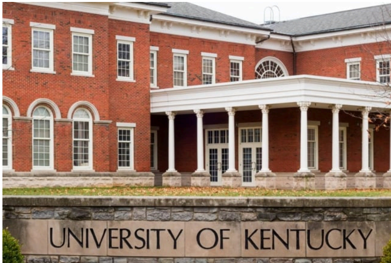
The University of Kentucky’s president has proposed dissolving the institution’s University Senate.