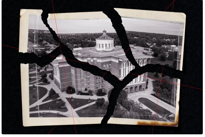
ILLUSTRATION BY THE CHRONICLE

For months, faculty members at the University of Kentucky <u>have</u> <u>criticized</u> what they see as an attempt by administrators to strip them of power. Now, some are worried they'll be retaliated against for opposing those changes.